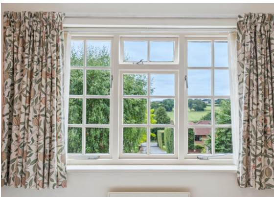
Illustration for identification purposes only, measurements are approximate, not to scale. © CJ Property Marketing Produced for Rodgers Estate Agents

Important Notice: Rodgers Estate Agents give notice that their solicitors and any joint agents give notice that: