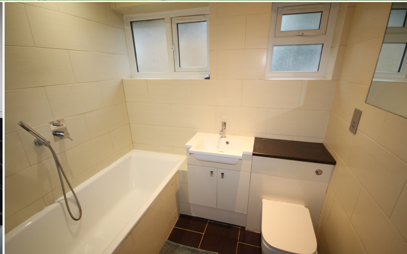
Merle Avenue Harefield, Middlesex, UB9 6DE