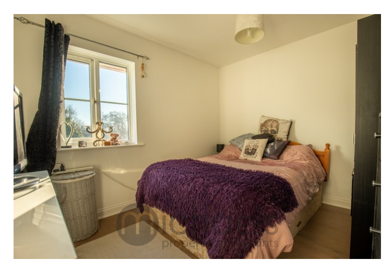
11' 4" x 9' 0" (3.45m x 2.74m) With UPVC double glazed window, electric heater.