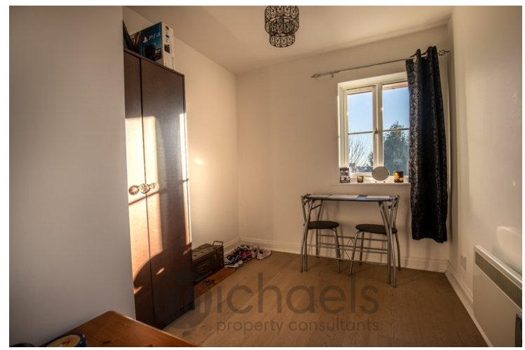
9' 0" x 8' 0" (2.74m x 2.44m) With UPVC double glazed window, electric heater.