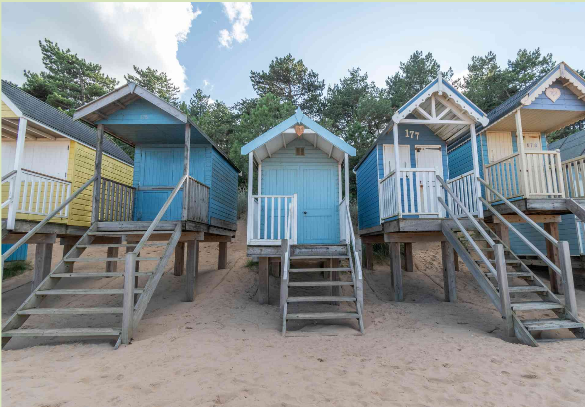
Beach Hut 176, Wells next the Sea Guide price £85,000