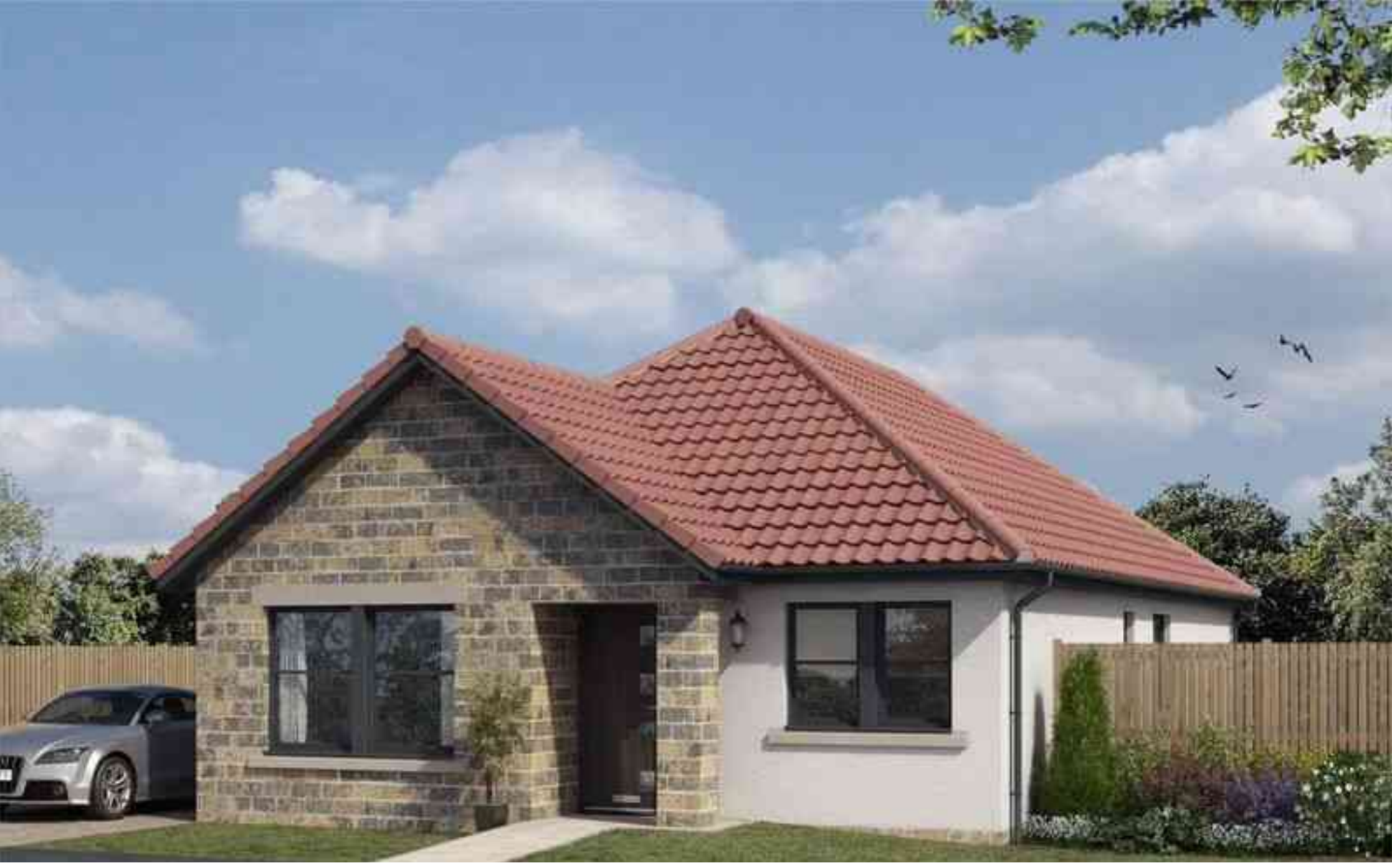
Fixed Price £319,000 PLOT 148 FIDRA SPECIAL, The Avenue, Lochgelly, KY5 9BF