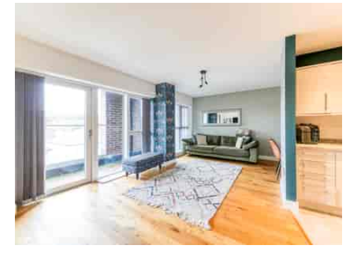
Red Deer Court, 4 Sanderstead Road, South Croydon, Surrey, CR2 0FG £110,000 Leasehold