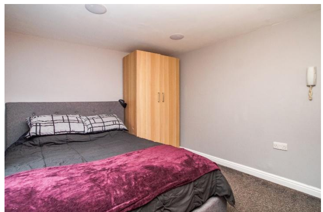
GROUND FLOOR BEDROOM