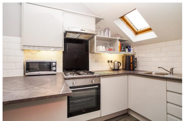
OPEN PLAN DINING LOUNGE & KITCHEN

OUTSIDE To the front of the property is a shared access courtyard for neighbouring properties with archway leading through on to Castlegate.