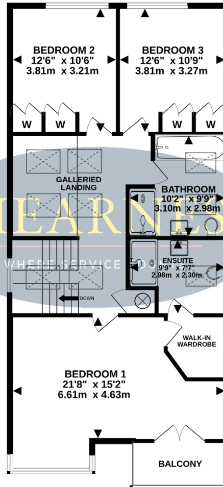
1ST FLOOR 966 sq.ft. (89.8 sq.m.) approx.