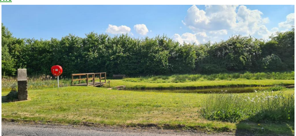
Views from the 2<sup>nd</sup> Floor Main Bedroom