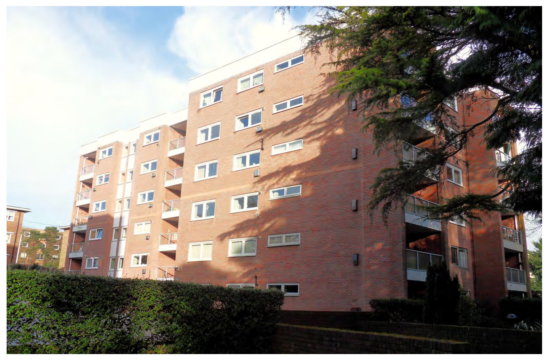
Lindsay Manor 47 Lindsay Road, Branksome Park BH13 6BE