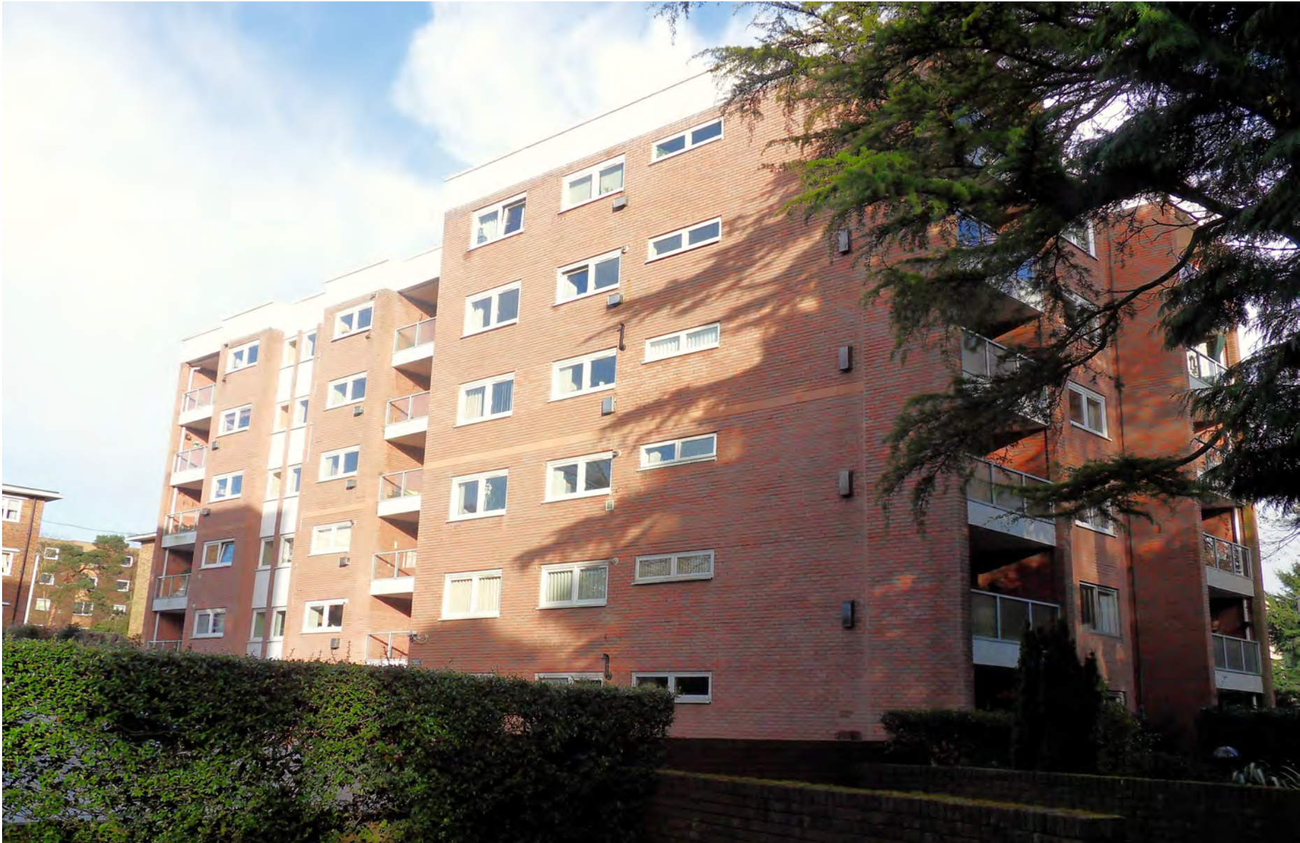
Lindsay Manor 47 Lindsay Road, Branksome Park BH13 6BE