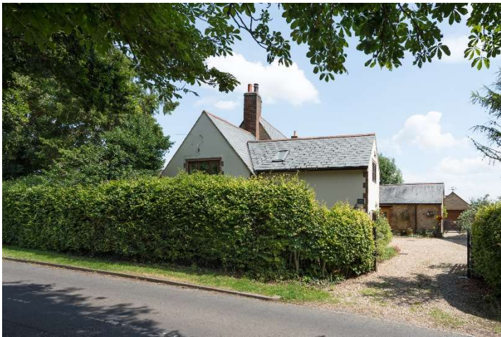
Bridge Cottage, Bridge End Radwell, Bedfordshire MK43 7HU