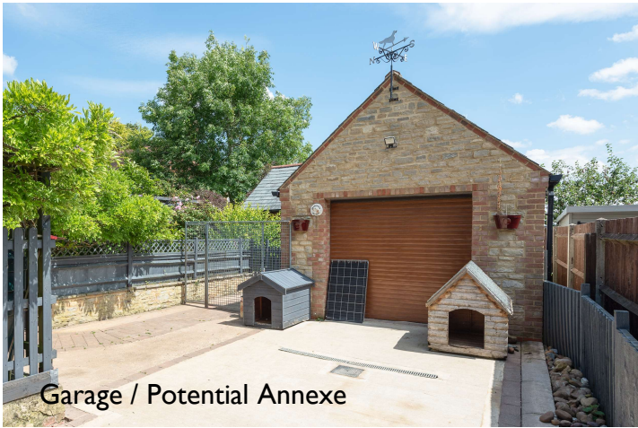
Garage / Potential Annexe