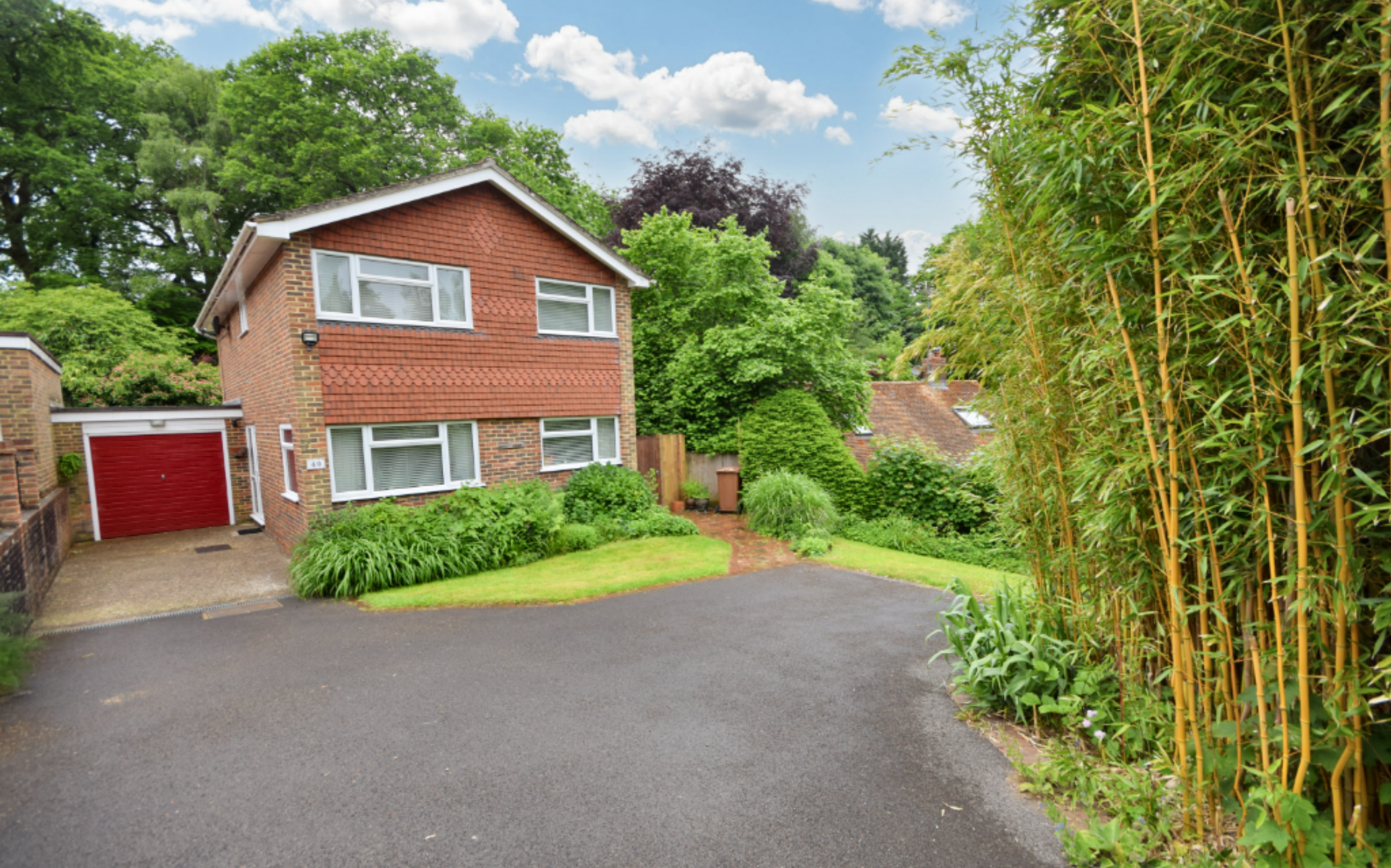
Harkwood, 40 Sandrock Hill Road, Wrecclesham, Farnham, Surrey. GU10 4RJ. Fixed Price £700,000