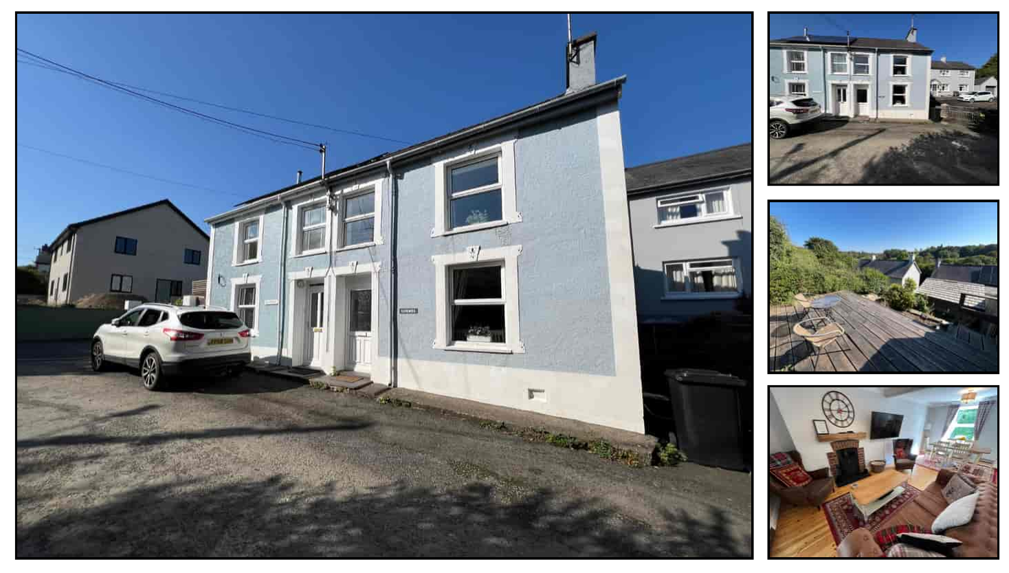
A deceptively spacious 3 bed semi detached residence. Located in the poular coastal village of Llanarth Near New Quay - West Wales.

Estate Agents | Property Advisers Local knowledge, National coverage