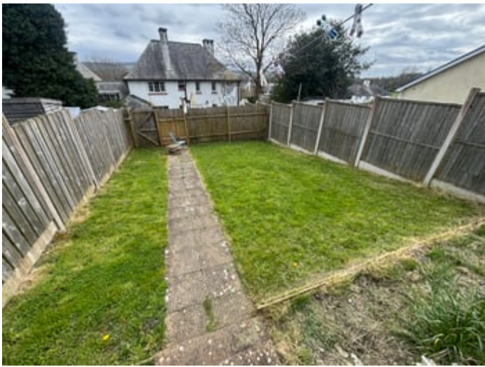
GARDEN (FOURTH IMAGE)