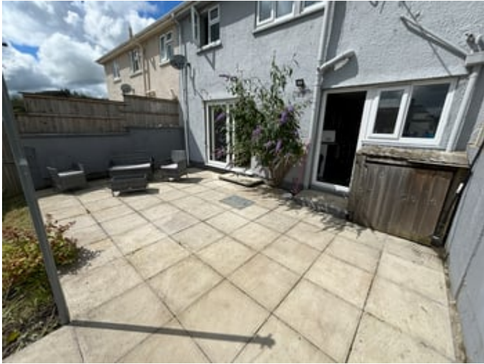
GARDEN (THIRD IMAGE)