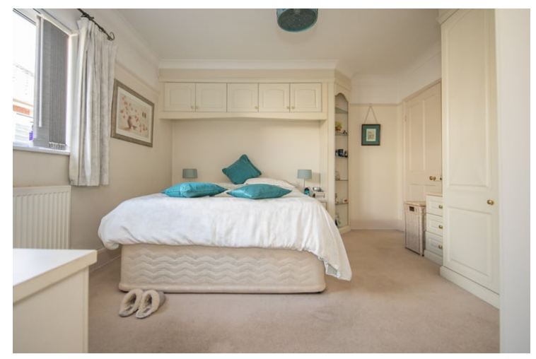
12' 05" x 12' 01" (3.78m x 3.68m) Double glazed window to side, radiator, fitted wardrobes, door to: