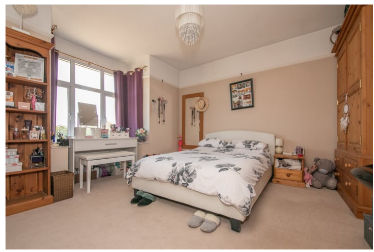
12' \ 01'' \times 12' \ 01'' \ (3.68m \times 3.68m) Double glazed bay fronted window, radiator.