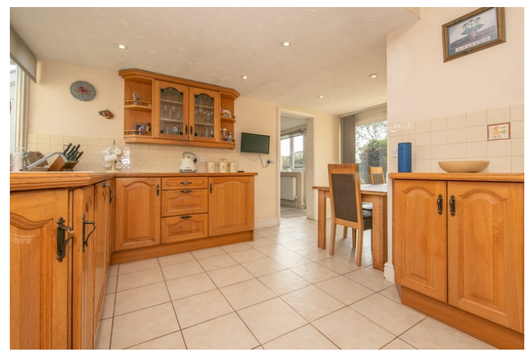
13' 9" x 9' 4" (4.19m x 2.84m) Turning to 6' 10" x 6' 11" (2.08m x 2.11m