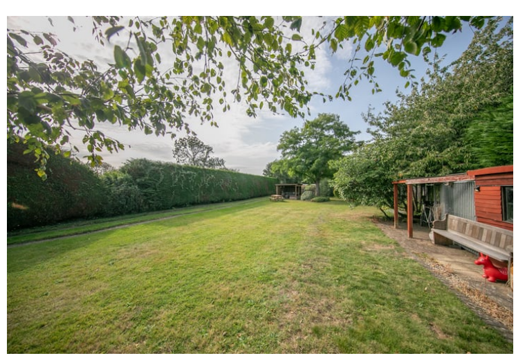
A beautifully maintained private well established rear garden mainly laid, patio area along with outside brick and timber built Arbour, garden shed and along with a two further sheds and card lodge behind the main garden hedging. Retained by privacy fencing.