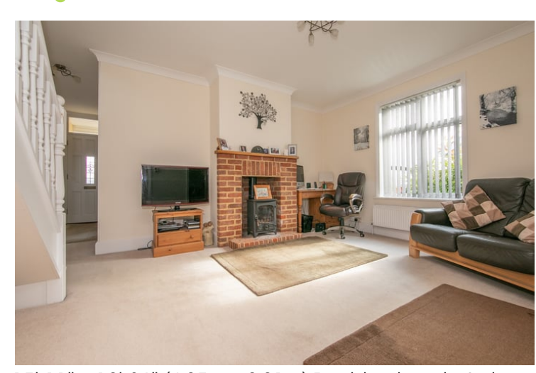
15'\ 11''\ x\ 12'\ 06''\ (4.85m\ x\ 3.81m) Double glazed window to side, radiator, brick fireplace with log burner, stairs to first floor.