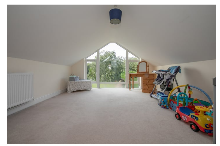
15' 5" x 13' 0" (4.70m x 3.96m) Double glazed vaulted window feature, radiator, eves storage.