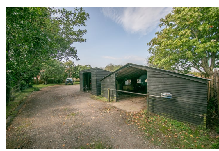
Ample off road parking to the front driveway with side acess for vehicles to acess to rear garden with cart lodge.