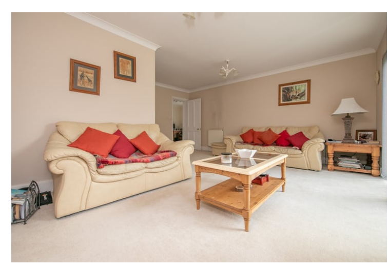
17' 10" x 18' 6" (5.44m x 5.64m) Narrowing to 10'10 Double glazed window and patio door to rear, radiator, marble hearth, views onto the rear garden.