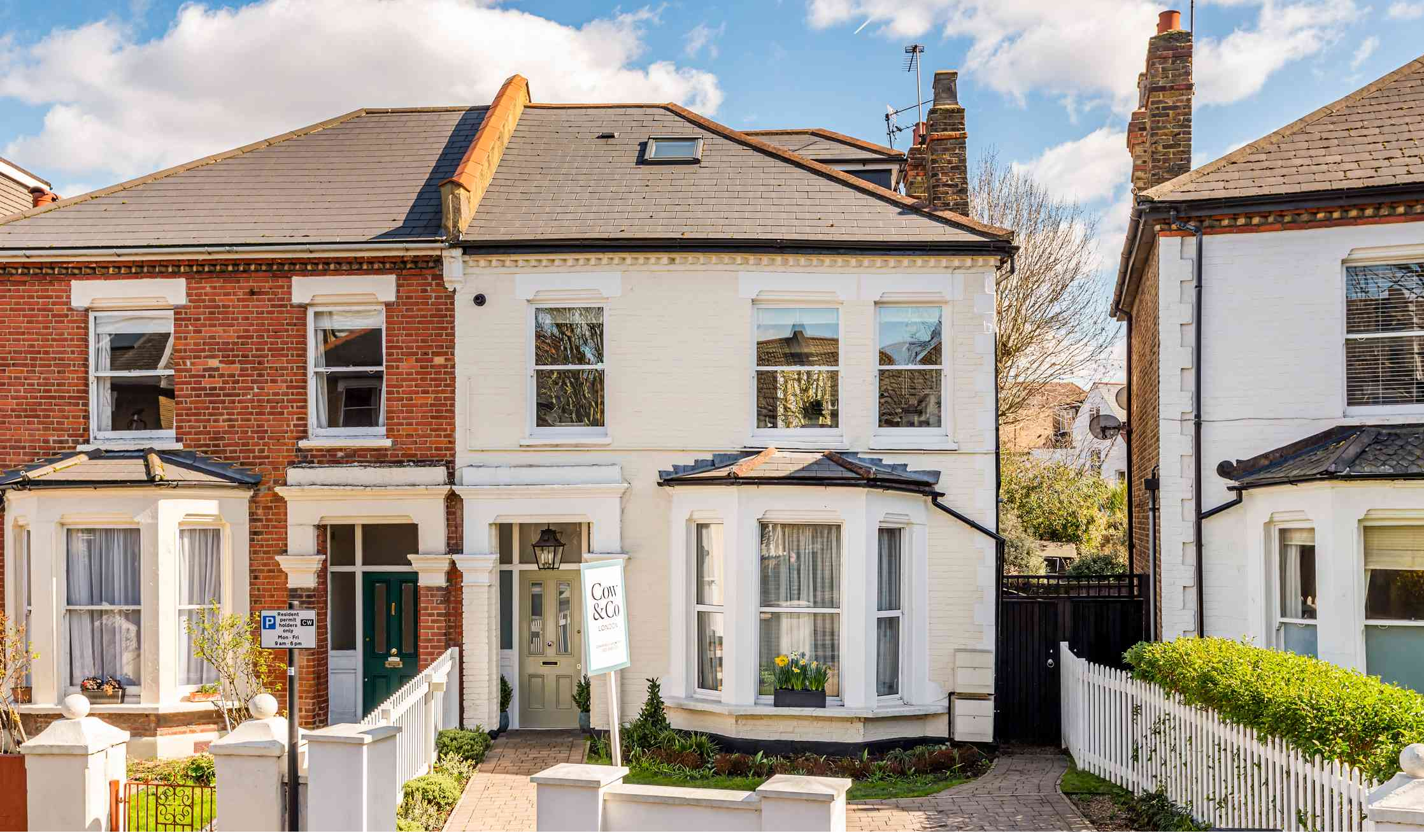
Heathfield Gardens, London, W4 4JU