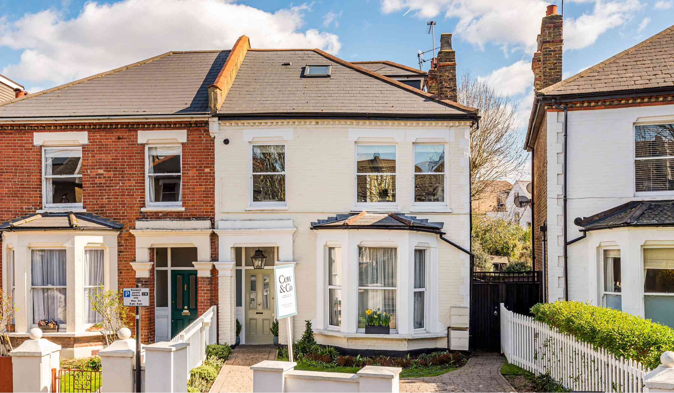
Heathfield Gardens, London, W4 4JU