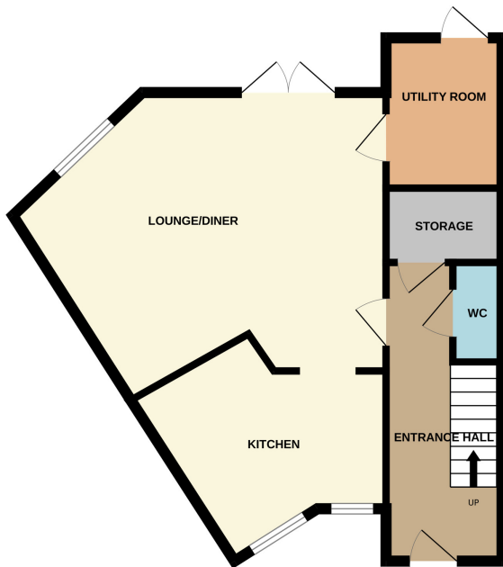
GROUND FLOOR 516 sq.ft. (47.9 sq.m.) approx.