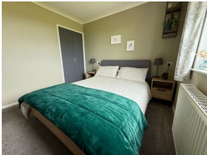
Rear Bedroom 3 / Dressing Room

11' 0" x 7' 11" (3.35m x 2.41m) with central heating radiator, built in wardrobes.