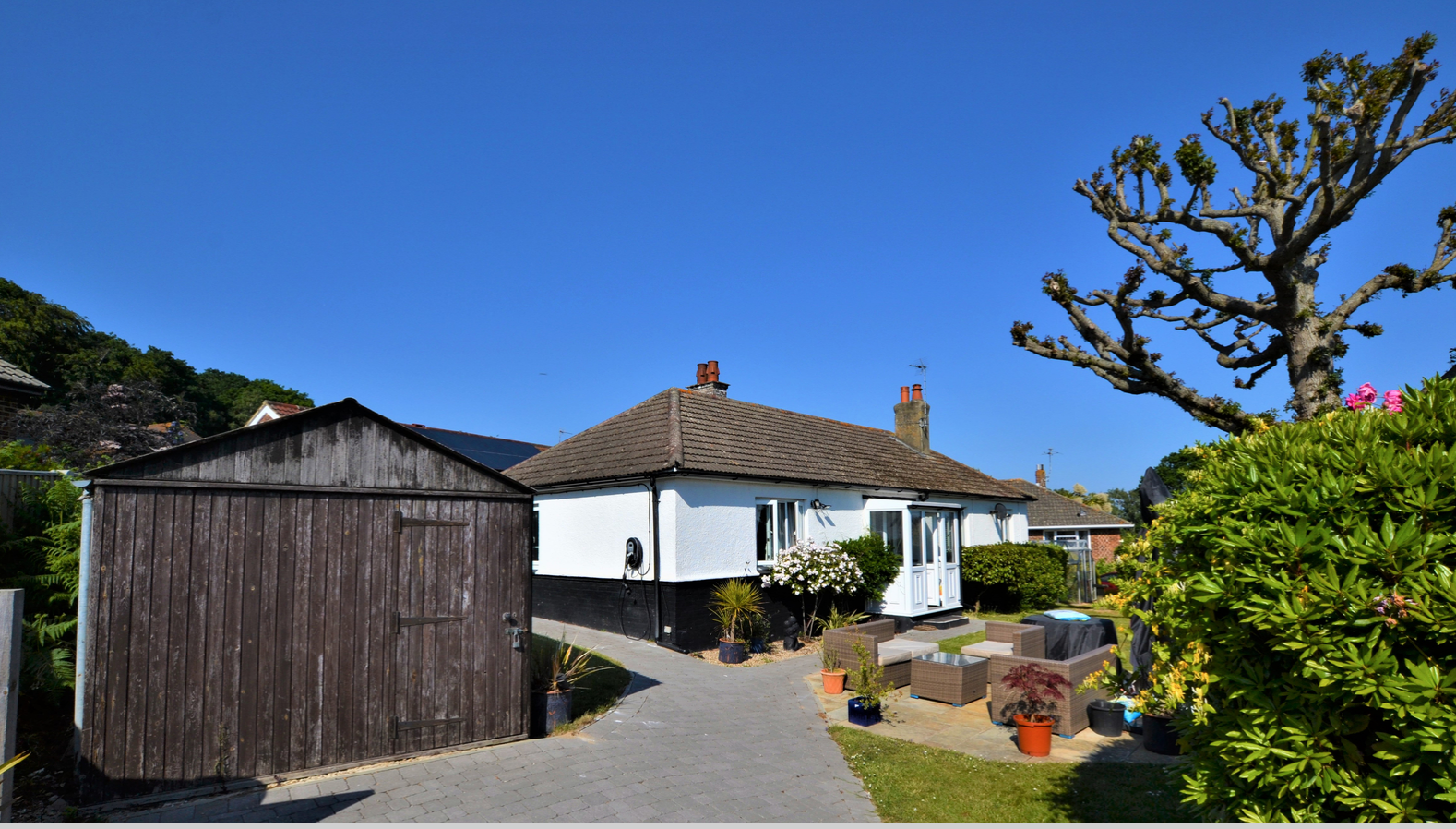
1 Beech Close, Bexhill-on-Sea, East Sussex, TN39 4NW