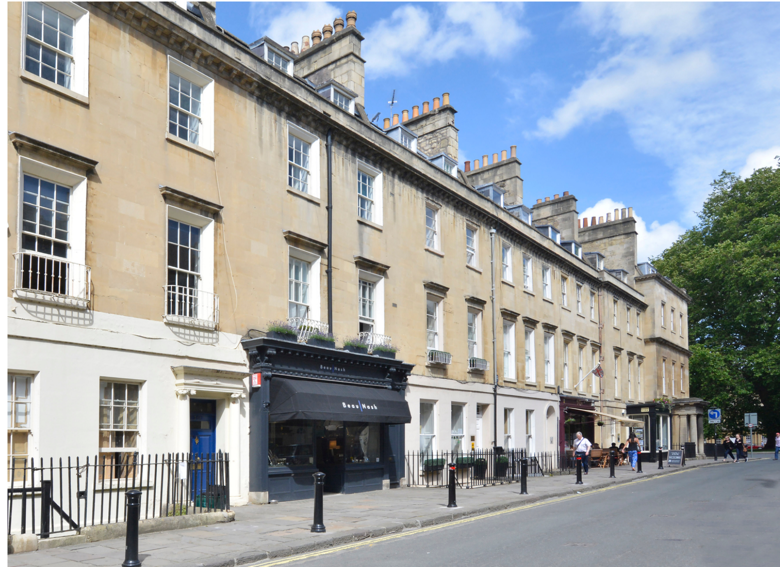
Brock Street, Bath