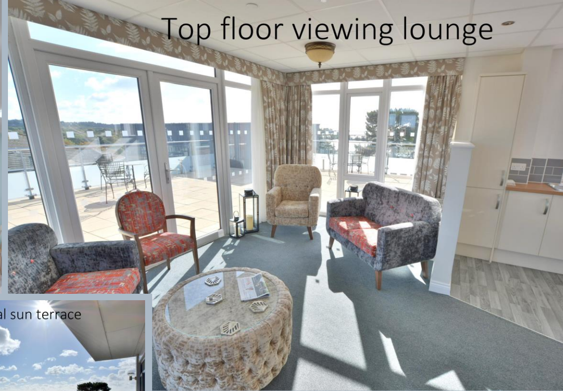
Communal sun terrace