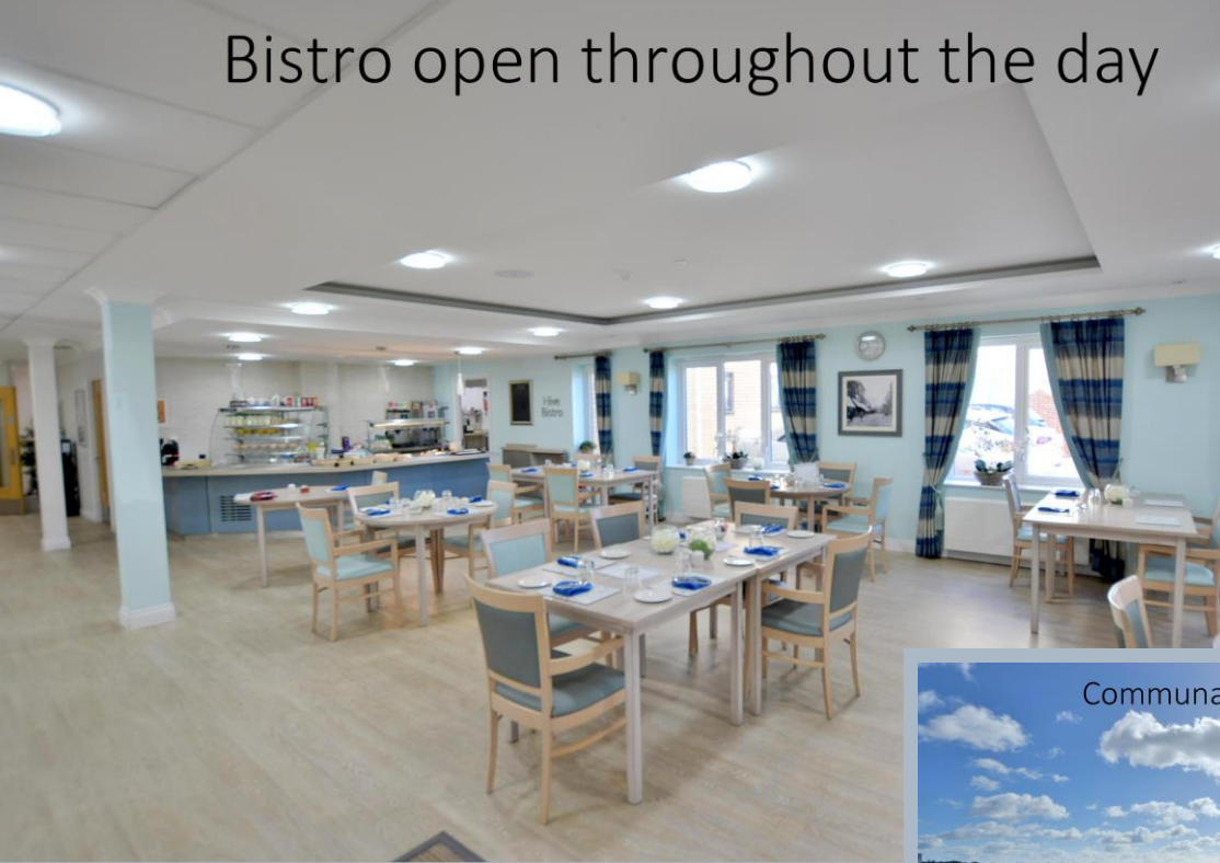
Bistro open throughout the day