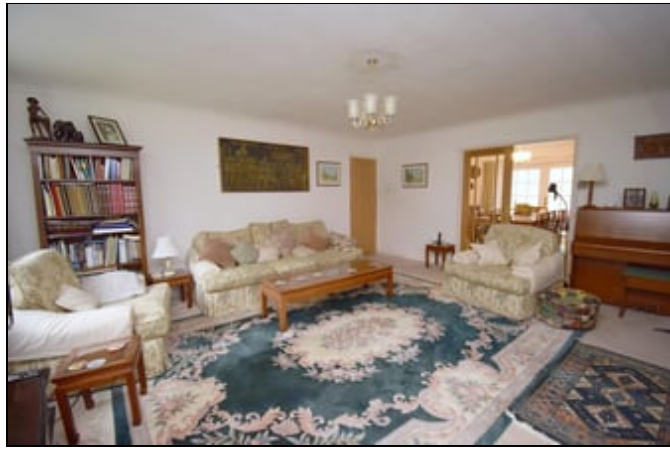
16' 0" x 18' 7" (4.88m x 5.66m)

The spacious South facing lounge opens into the dining area, allowing an area of perfect flow for entertaining and family space. The two large UPVC windows to the front ensure a bright and airy living space, with skirting radiator and covered cornice.