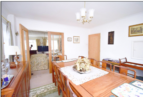
66 ST JAMES'S ROAD, SEVENOAKS, KENT TN13 3NG

Down an extremely desirable private road is this attractive, Georgian style detached home. Set back from the road, partially hidden behind trees and bushes, this 4 bedroom property features a large lounge and dining area, garden and garage. Moments away from a reputable primary school, and walking distance to Sevenoaks town and station, this property has it all, with fantastic location and space, as well as offering great potential to extend and refurbish to your own tastes.