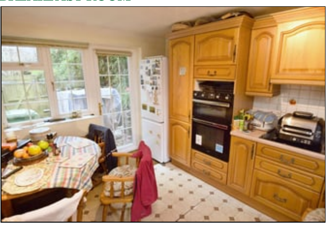
9' 4" x 13' 0" (2.84m x 3.96m)

A perfect extended kitchen space for breakfast looking out to the garden and courtyard, or for utilities, this room adjoins the kitchen and has a double bowl stainless steel sink with mixer tap, ground and wall oak fronted cupboards, a multi-paned window to the rear and front, space and plumbing for a washing machine, alongside ceramic splashback tiling, covered cornice, space for a fridge/freezer and worktops.