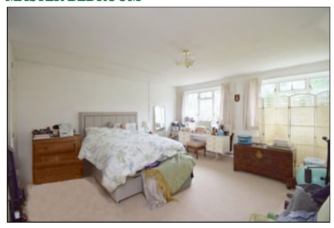
15' 11" x 14' 11" (4.85m x 4.55m)

Presenting plenty of integrated storage, with two built in double wardrobes, built in bedhead with shelved cupboards to either side, and a further build in wardrobe cupboard. The two large UPVC sealed unit double glazed windows to the South facing front make the room extremely bright, accentuating its capaciousness.