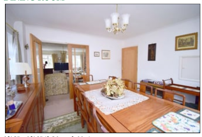
12' 8" x 12' 0" (3.86m x 3.66m)

Moving through the lounge, one is greeted with a dining space large enough to seat twelve. Two UPVC sealed unit double glazed windows to the side, with frosted glass, accompany the service hatch to the kitchen, covered cornice and large double doors into the conservatory.