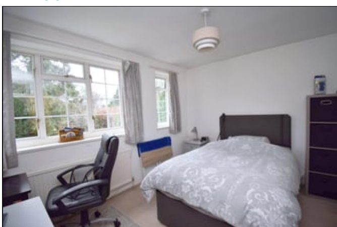
11' 8" x 10' 3" (3.56m x 3.12m)

The second largest bedroom, with two large, South facing, UPVC sealed unit doubled glazed windows to the front and a radiator.