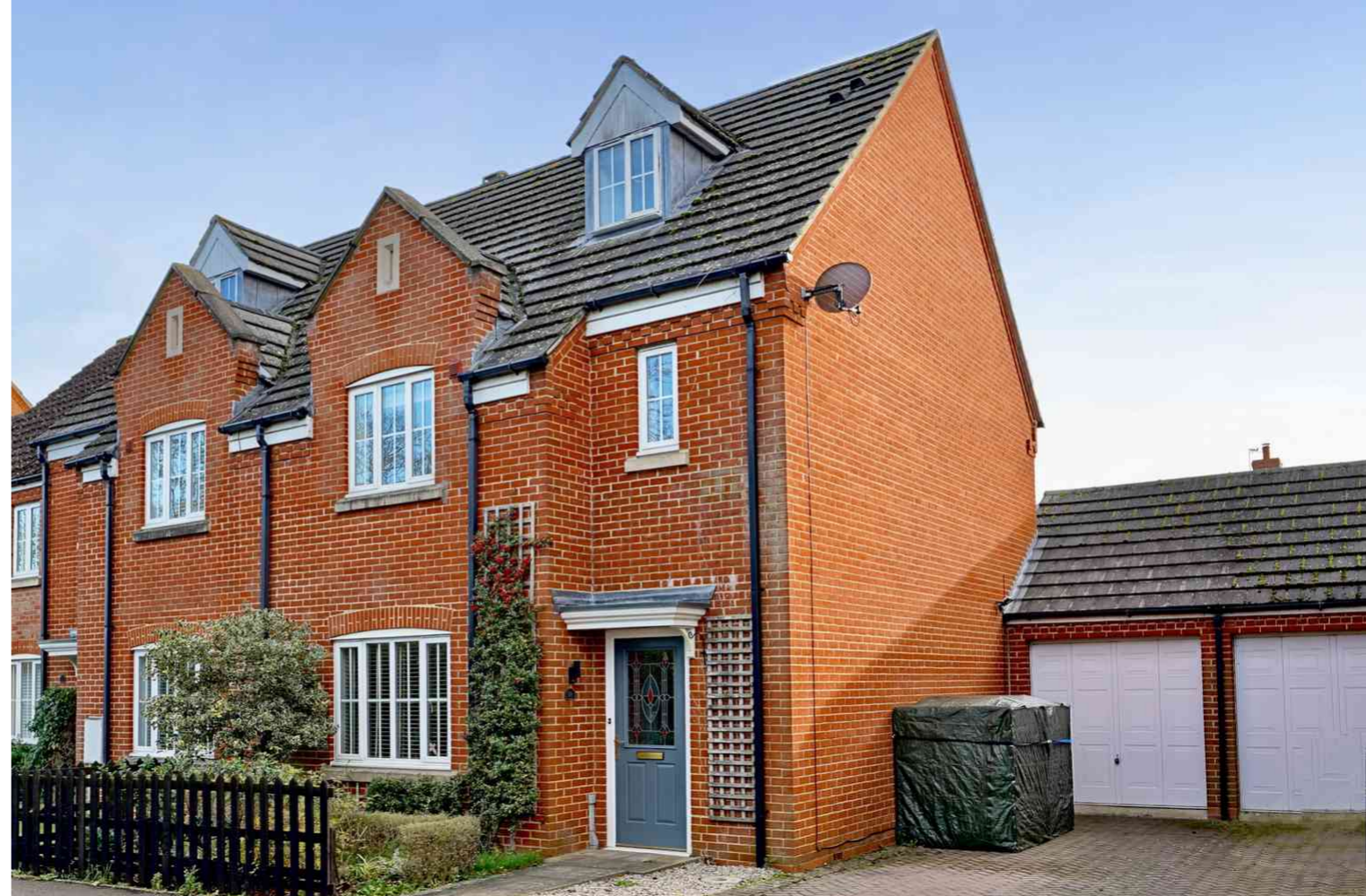
Beaufort Drive, Buckden PE19 5YU