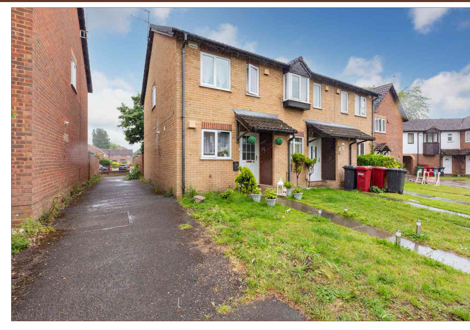
This lovely END OF TERRACE family home is located on a very popular quiet residential cul-de-sac close to Cippenham Village. The immediate location offers access to some fantastic local schools which makes this area popular with families of all ages. Fantastic public transport links are also on offer with Burnham train station (Elizabeth Line) and M4 jct 7 both being easily accessible.

The property itself has been very well maintained and is ready for the next family to move straight in. The home comprises of a spacious family lounge/dining room and kitchen on the ground floor. The kitchen is a stunning modern space with gas hob and space for appliances. Upstairs is home to all TWO bedrooms and the modern family bathroom. Patio doors in the lounge open up into your private rear garden.