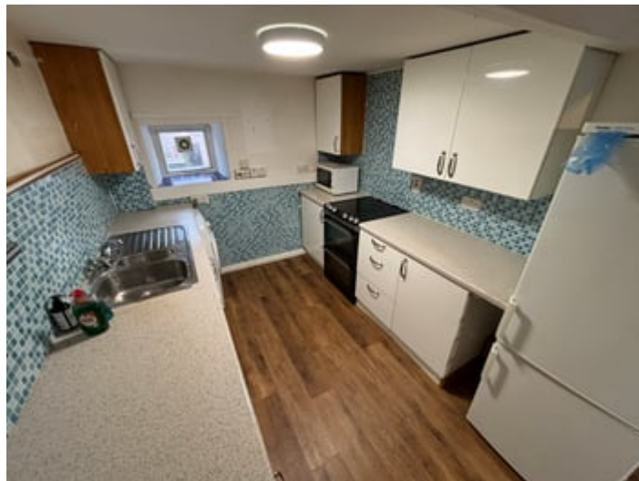
KITCHEN/DINING AREA (SECOND IMAGE)

18' 2" x 11' 7" (5.54m x 3.53m). Accessed via a front entrance door, single drainer stainless steel sink unit, base and eye level units with appliance spaces, plumbing and space for automatic washing machine, radiator, window to the fore and rear, storage cupboard.