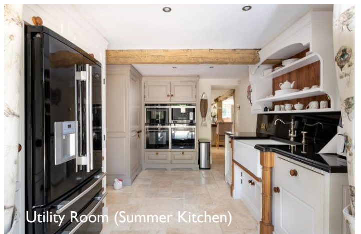
Utility Room (Summer Kitchen)