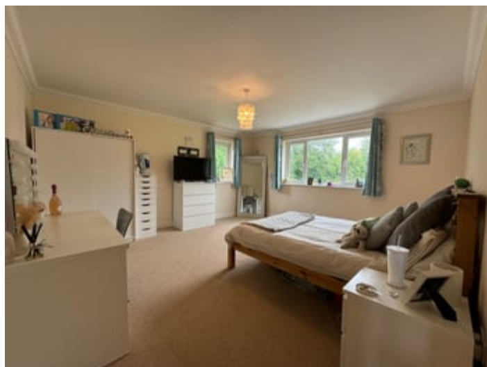
14' 7" x 14' 11" (4.45m x 4.55m) double bedroom, window to rear and side, multiple sockets, TV point.