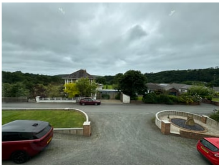
22' 2" x 20' 1" (6.76m x 6.12m) With dual aspect windows to front overlooking the adjoining countryside