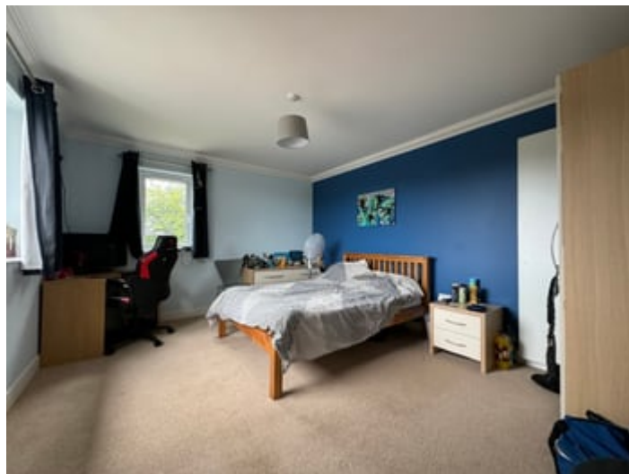
11' 8" x 14' 6" (3.56m x 4.42m) double bedroom, window to front, multiple sockets, TV point.