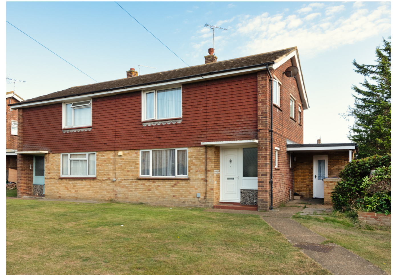
4 Sussex Close, Herne Bay, Kent, CT6 8DX