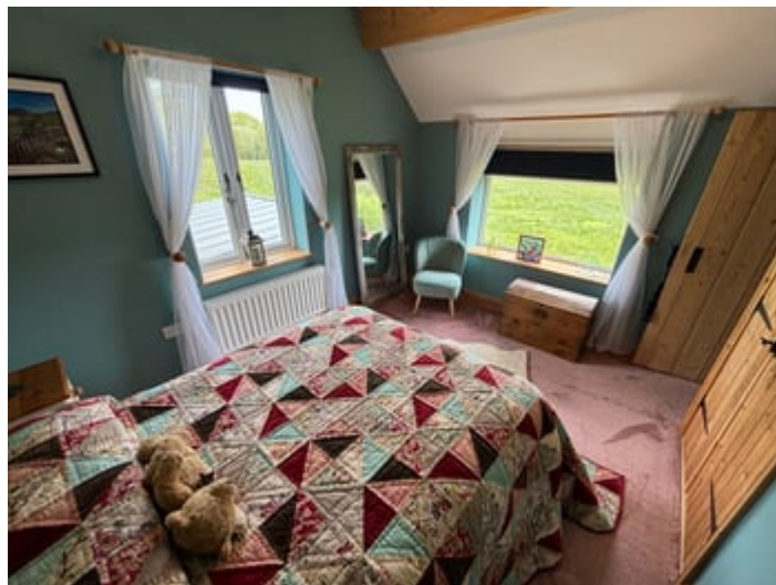
VIEW FROM BEDROOM 2