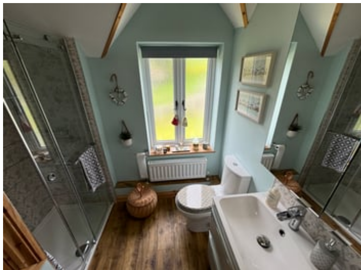
SHOWER ROOM (SECOND IMAGE)

A stylish modern suite with a 4ft shower cubicle, large linen cupboard with sliding tray, double drawer vanity unit with wash hand basin, low level flush w.c., radiator, laminate flooring, access to the loft space.