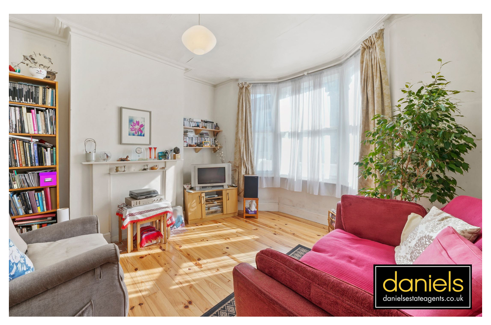
Greyhound Road, London NW10 5QH £870,000 - Freehold