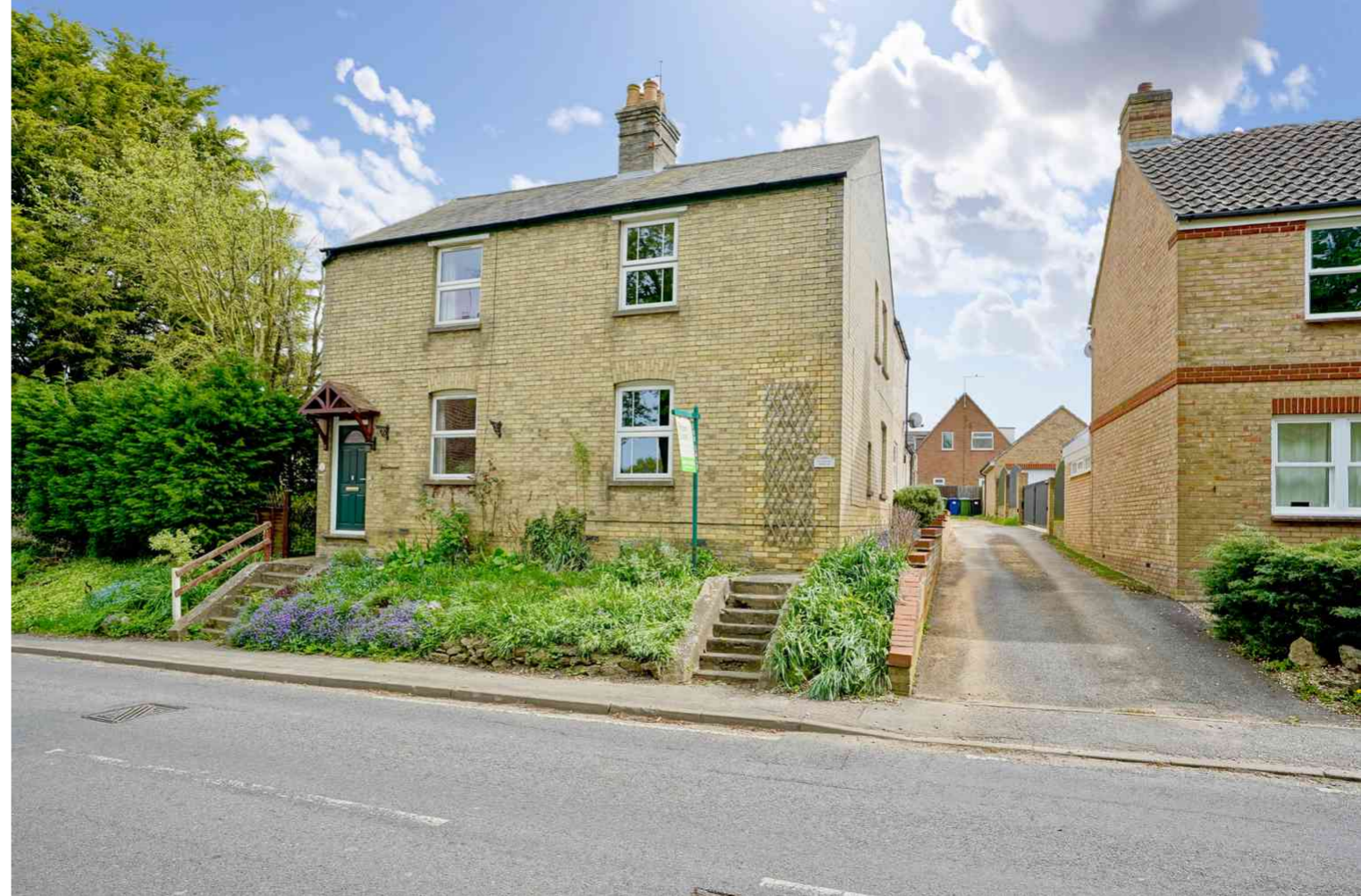
Ramsey Road, Kings Ripton PE28 2NW