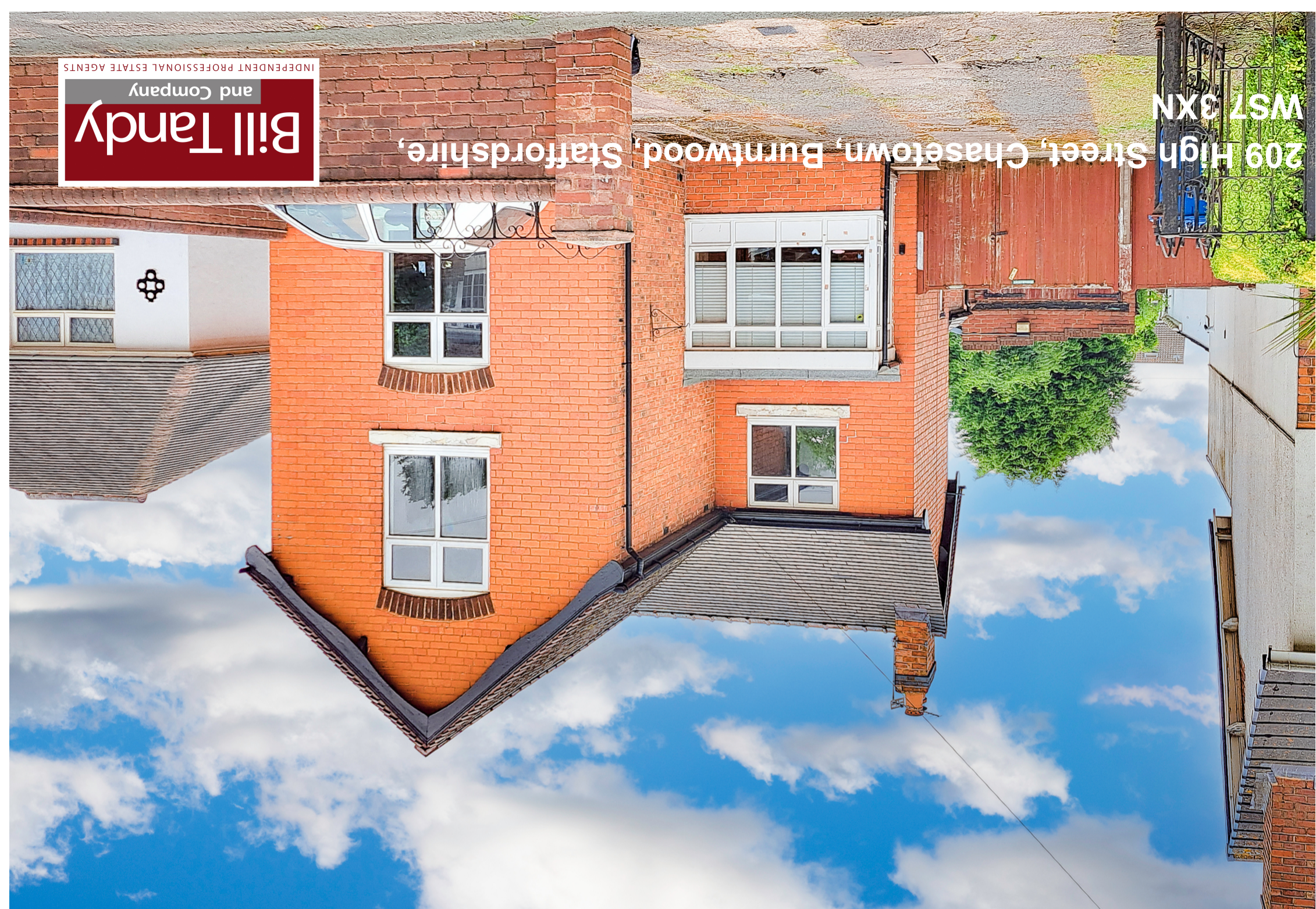
GROUND FLOOR 632 sq.ft. (58.7 sq.m.) approx.