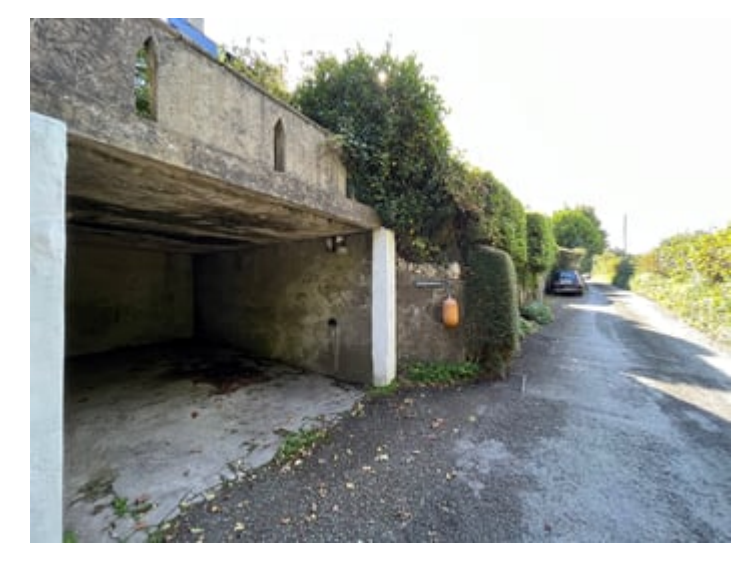
To the Rear

Side and rear garden predominantly laid to lawn with side concrete footpath leading to an elevated lawned area with corner Log Store.