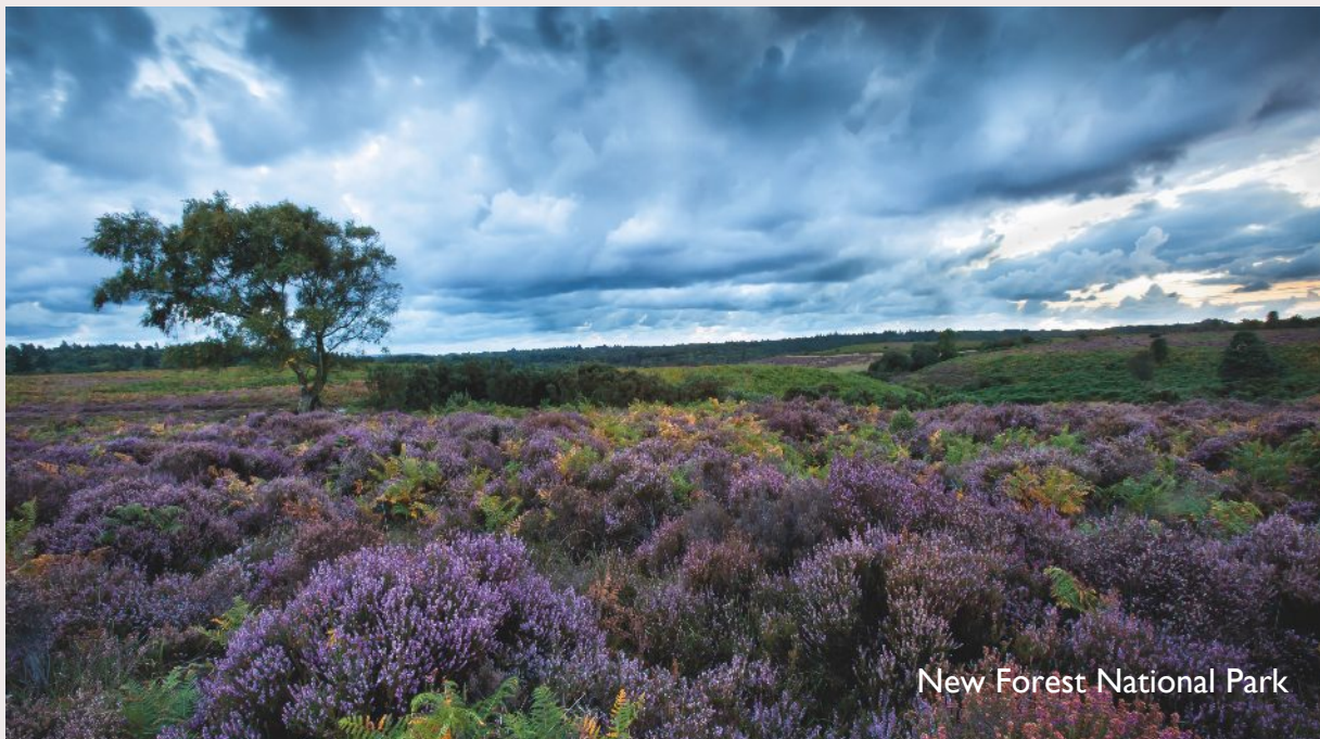
New Forest National Park

Bordeaux is nestled on the outskirts of Highcliffe, renowned for its pristine beaches and excellent amenities, perfectly epitomising luxurious living with its prime location