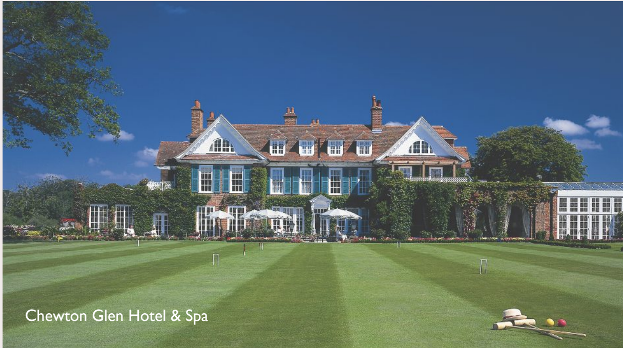
Chewton Glen Hotel & Spa

Bordeaux is nestled on the outskirts of Highcliffe, renowned for its pristine beaches and excellent amenities, perfectly epitomising luxurious living with its prime location