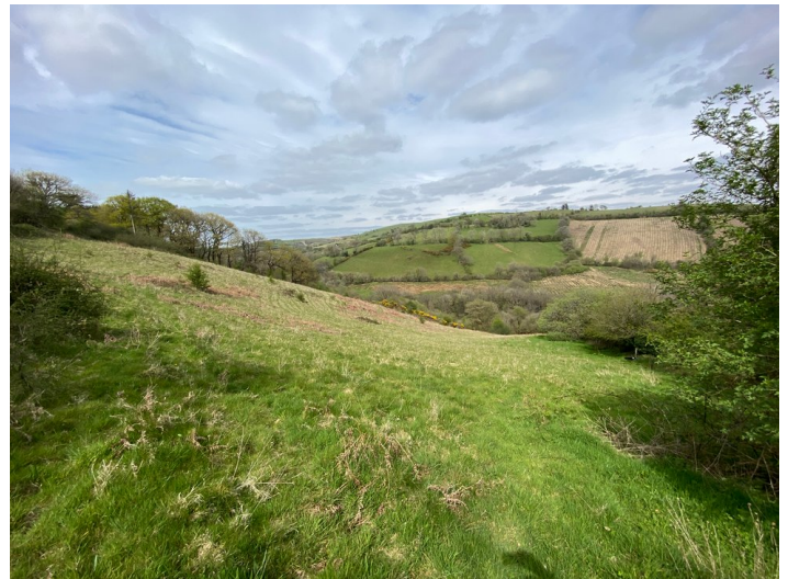
TRACK TO RIVER MEADOW