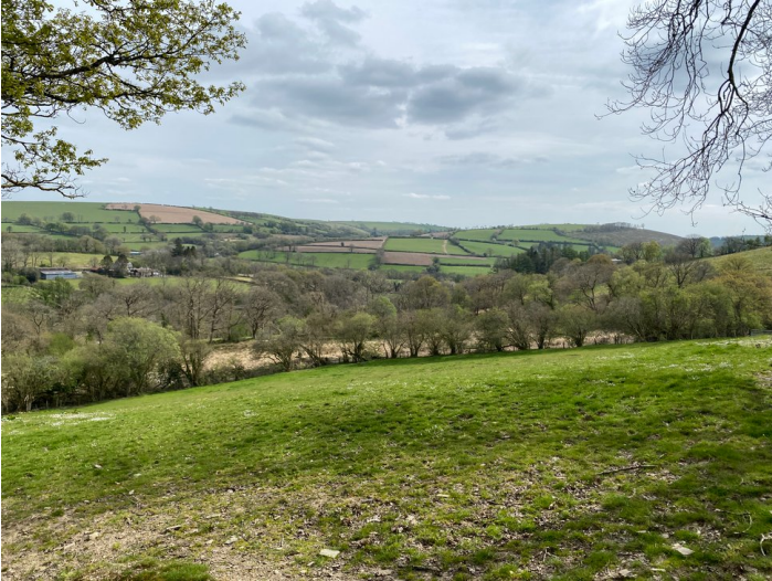
LAND (SECOND IMAGE)

The land is healthy productive pasture including grazing and river meadows, all with internal fencing and traditional hedging providing adequate shelter. The majority has water available and the land encompasses various pockets of deciduous native oak woodland and conservation areas intersected by a stream which would be ideal for creation of ponds or planting for additional woodland including various areas providing rich habitats for wildlife. In all a delightful smallholding extending in total to some 18.2 acres or thereabouts.