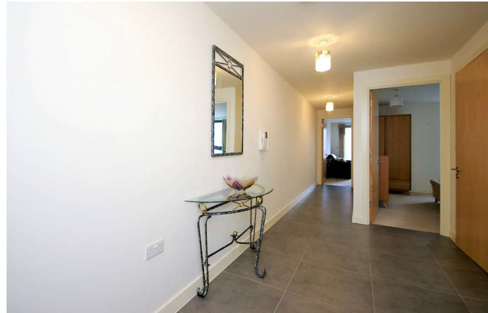
Metropolitan Court, High Road, Willesden Green, London NW10 2QD £389,000 - Leasehold