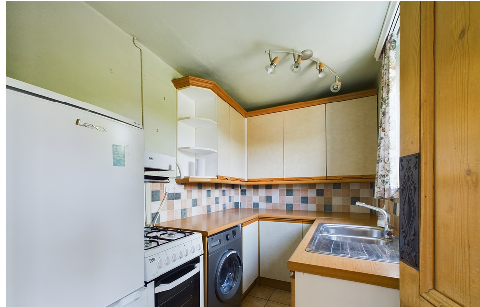
West Bank, Ambergate, Belper, Derbyshire DE56 2GF £150,000 - Freehold