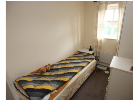
10 Watkin Walk, Biggleswade, Bedfordshire, SG18 0BA