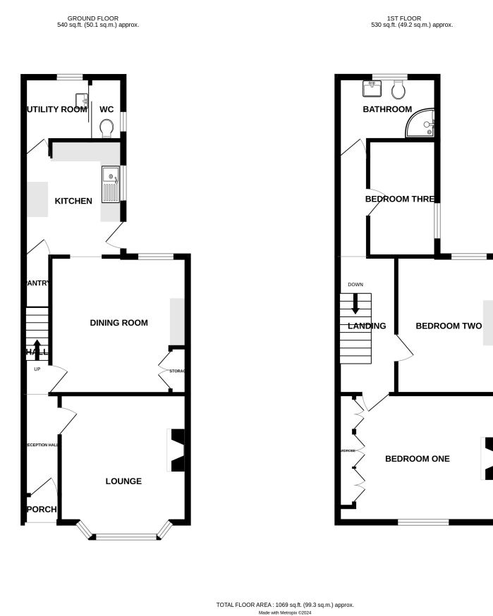
TOTAL FLOOR AREA: 1069 sq.ft. (99.3 sq.m.) approx. Made with Metropix C2024