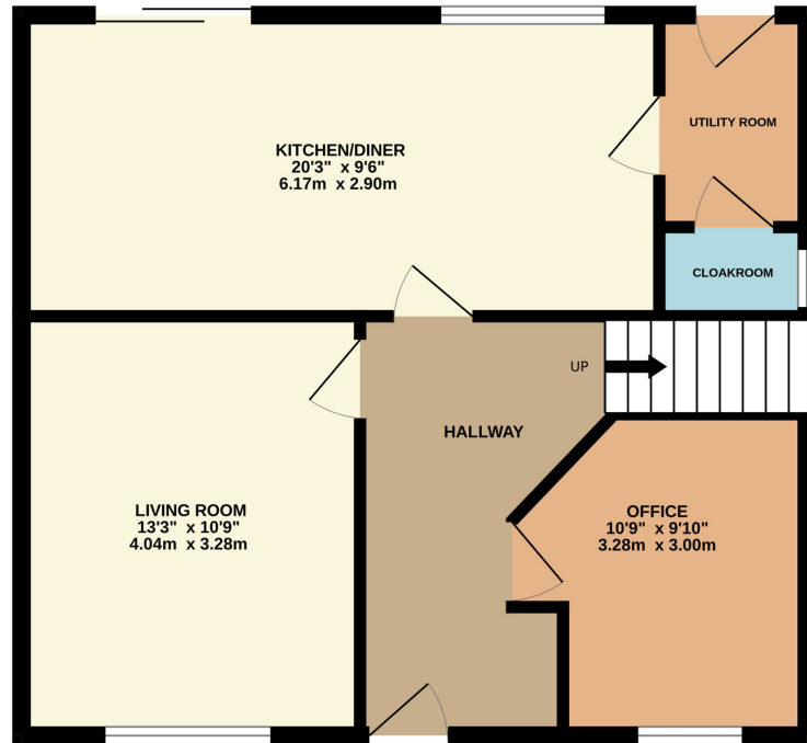
GROUND FLOOR 569 sq.ft. (52.9 sq.m.) approx.