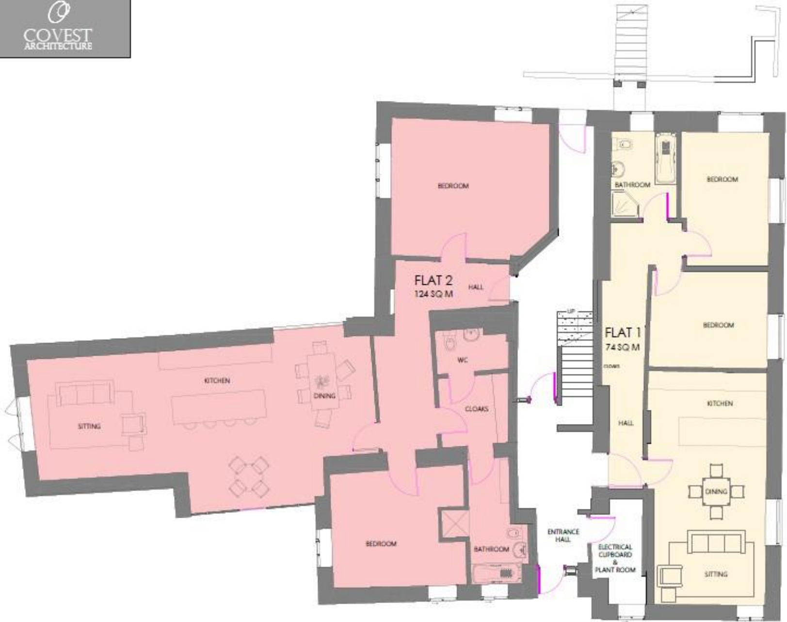
Proposed Ground floor plan