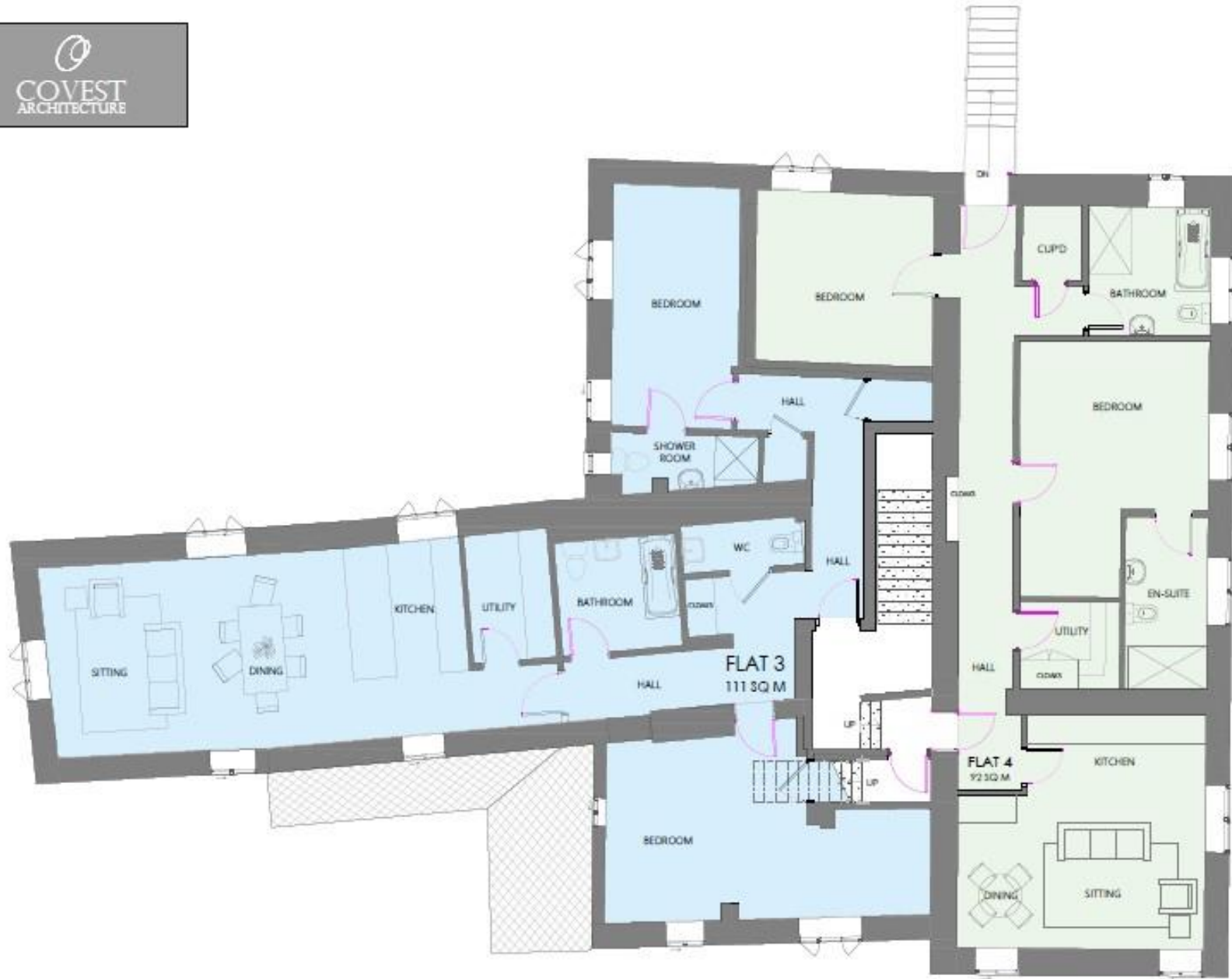
Proposed First floor plan