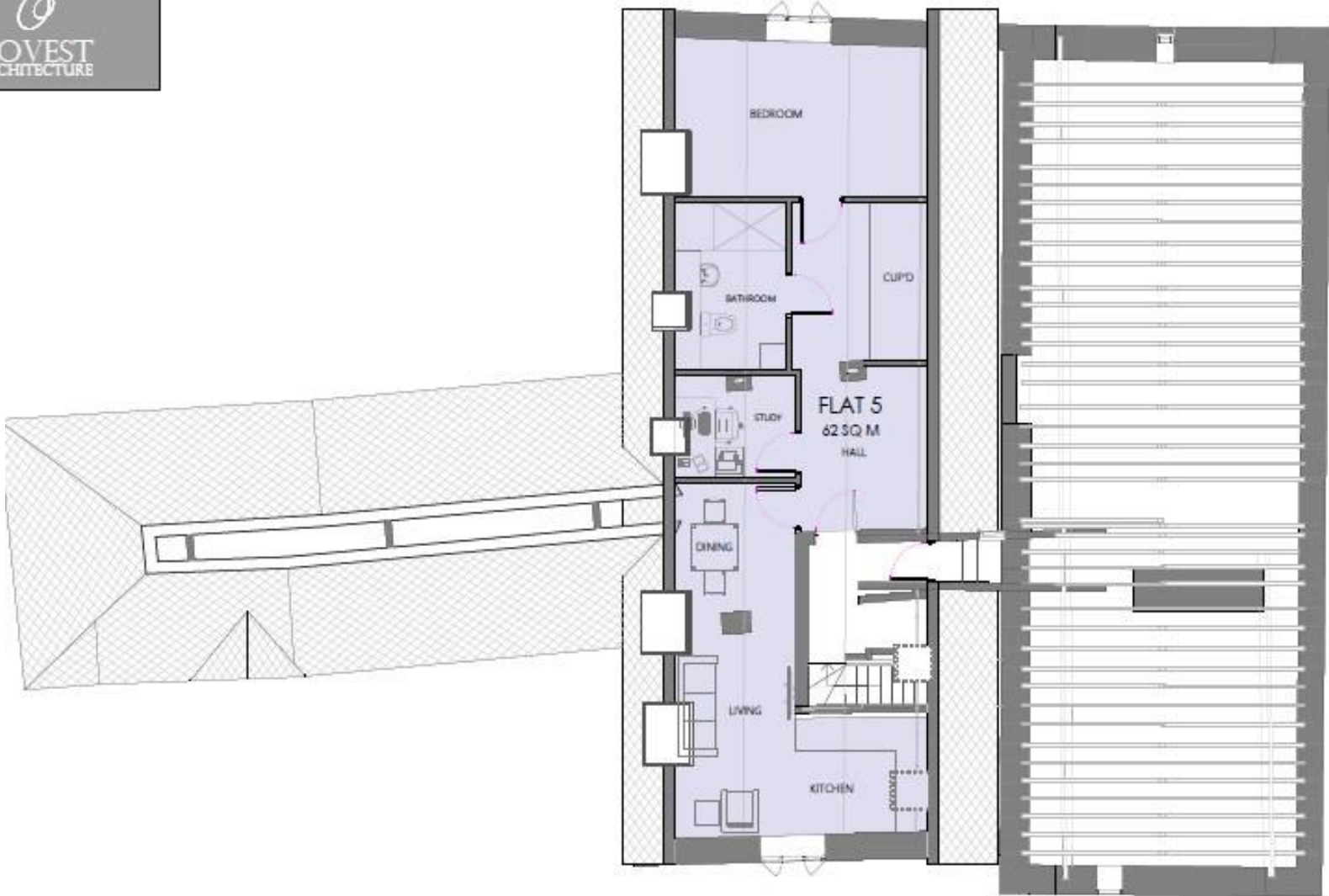
Proposed Second floor plan