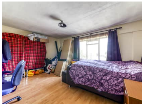
Regina Road, London, SE25