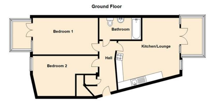
Floor plans are for layout purposes only. Measurements are approximate and subject to inaccuracie

Whilst we have endeavoured to prepare our sales particulars accurately none of the services, appliances or equipment have been tested. A buyer should satisfy themselves on such matters prior to purchase. Any measurements or distances mentioned in these particulars are for guide reference only. If such particulars are fundamental to a purchase, buyers should rely on their own enquiries. All enquiries should be directed to Elevation Estate Agents in the first instance.