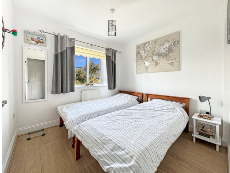
9' 3" x 9' 0" (2.82m x 2.74m) Window to rear and radiator.