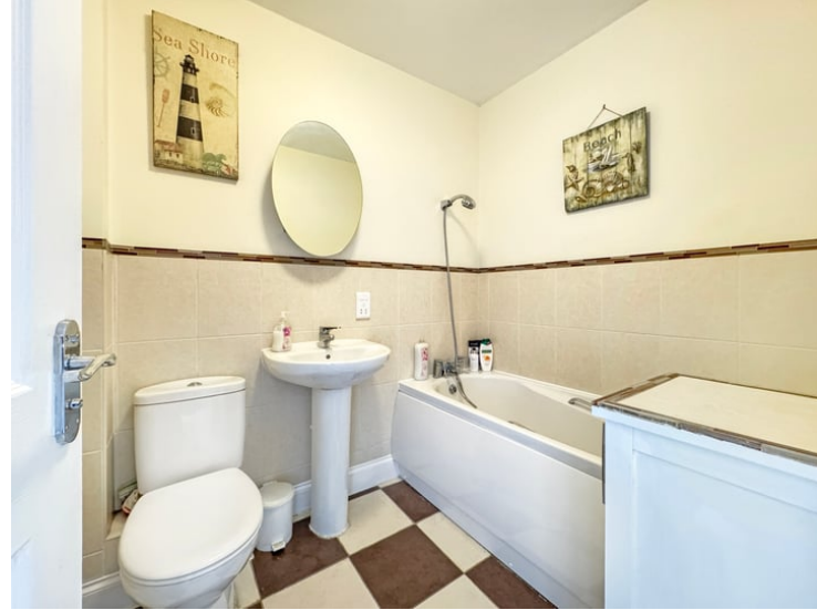
Panel bath, close coupled WC, pedestal wash hand basin, half tiled walls, heated towel rail.