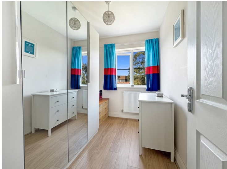
9' 0" x 6' 7" (2.74m x 2.01m) Window to rear and radiator.