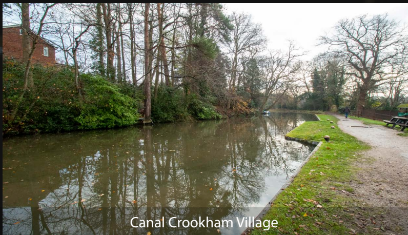
Canal Crookham Village