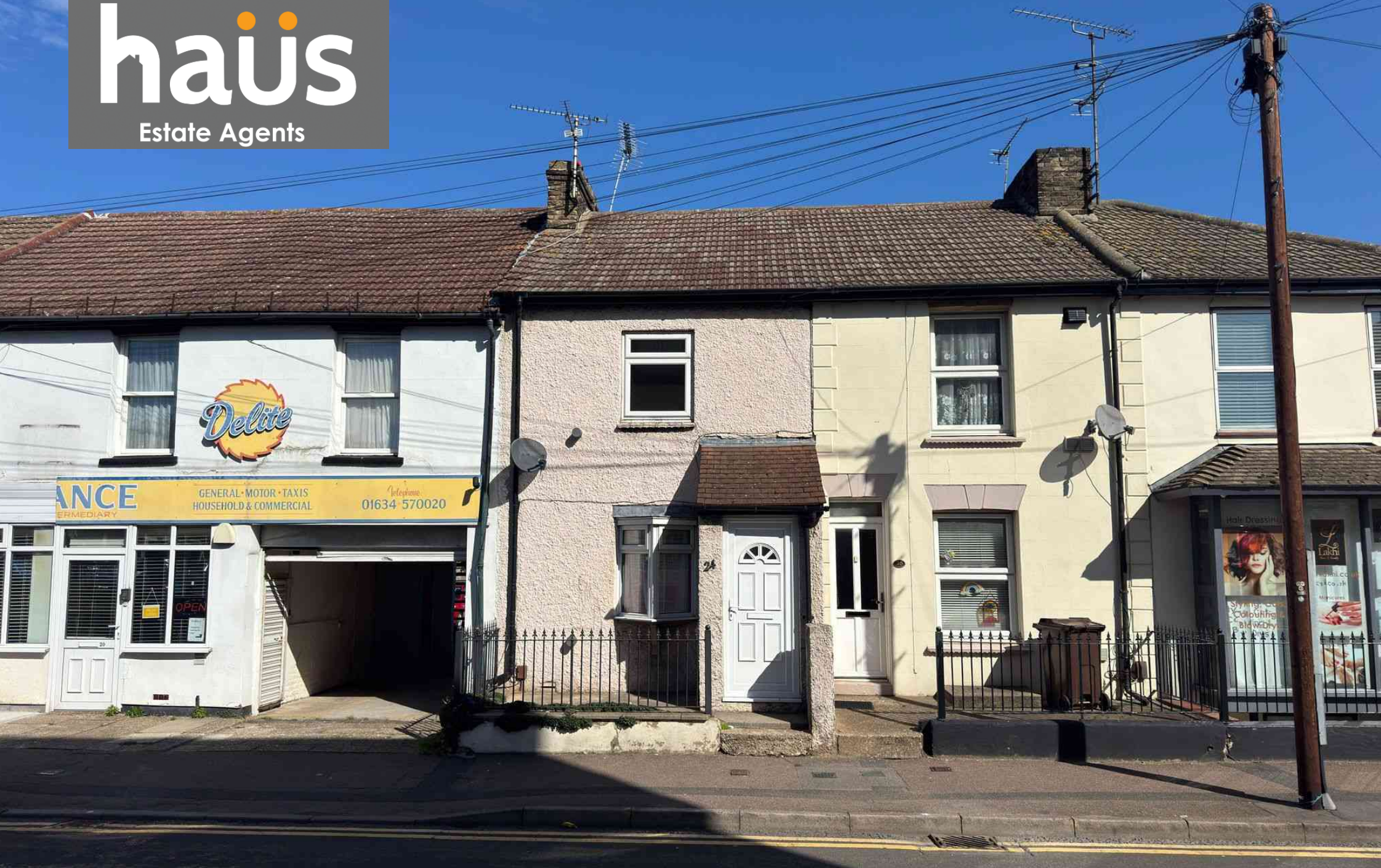
Two Bedroom Terraced House Jeffery Street, Gillingham, Kent, ME7 1DE