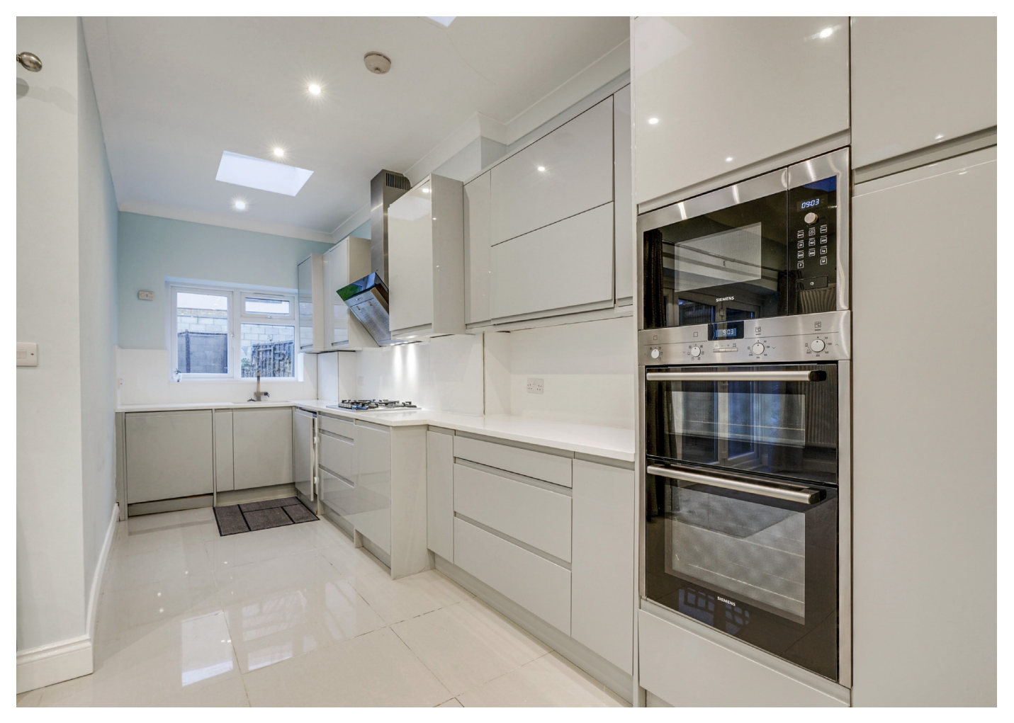
5 BEDROOM HOUSE