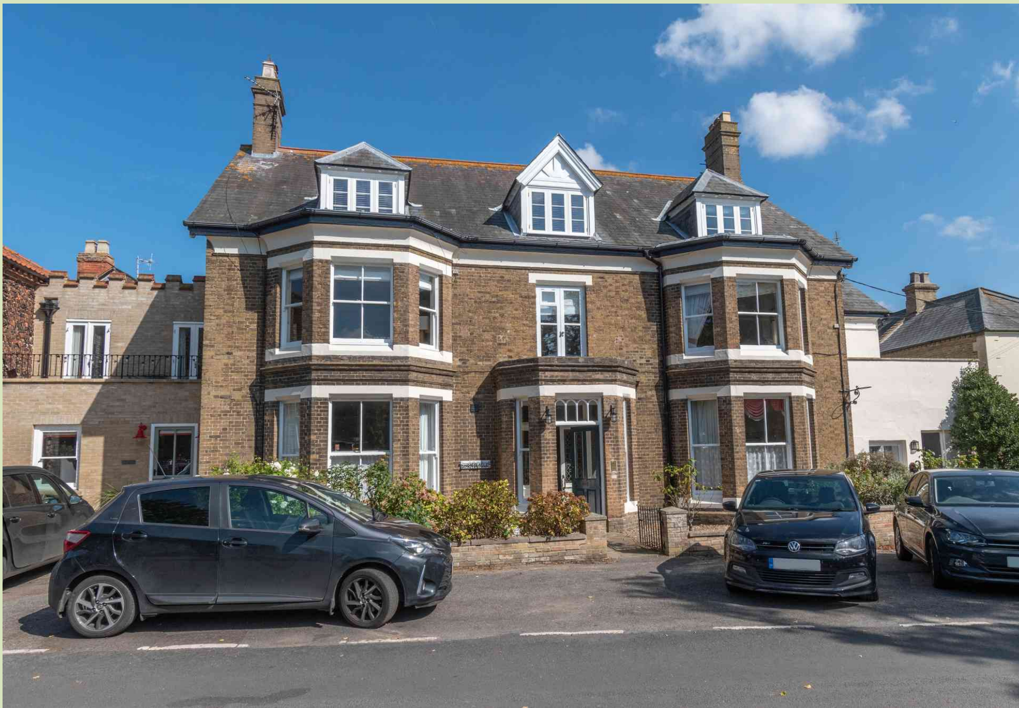
6 Monteagle House, Wells-next-the-Sea Guide Price £250,000